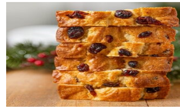
Cranberry Orange Bread