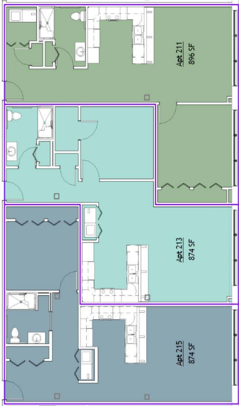
1 BEDROOM EXAMPLE LAYOUTS