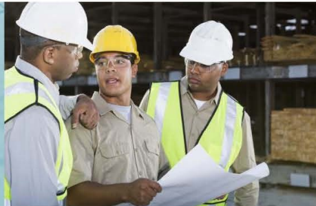
Journeyman Earnings after Four years

When you're accepted into a registered Apprenticeship program, you receive Classroom training from instructors with practical experience, PLUS you get paid while learning on the job! The average apprentice earns about $19-$24/hr. plus benefits during on-the-job training (Depending on the trade). Apprenticeship training lasts three to five years depending on the trade.