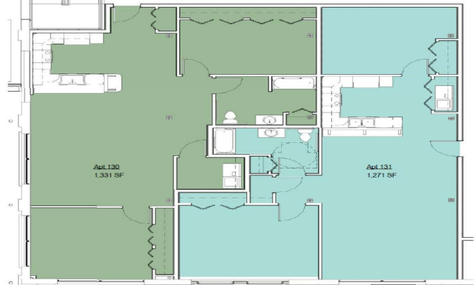
2 BEDROOM EXAMPLE LAYOUTS

Waite Rug Place's wait list is NOW OPEN! APPLY ONLINE at www.ohawcha.org