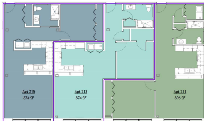
1 BEDROOM EXAMPLE LAYOUTS